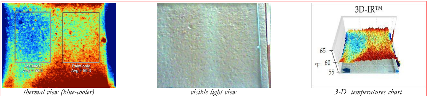
Heated foam box side-by-side comparison of Insuladd® (inside left /blue-cooler) to paint-only (inside right/red-green)

From the summer of 2008 to present we have continued various studies. One device we use is a thermal imager with sufficient sensitivity to pinpoint energy-loss in building structures. The imager effectively compares an Insuladd® treated surface with a painted-only surface side-by-side for qualitative illustration of the effect 1 :